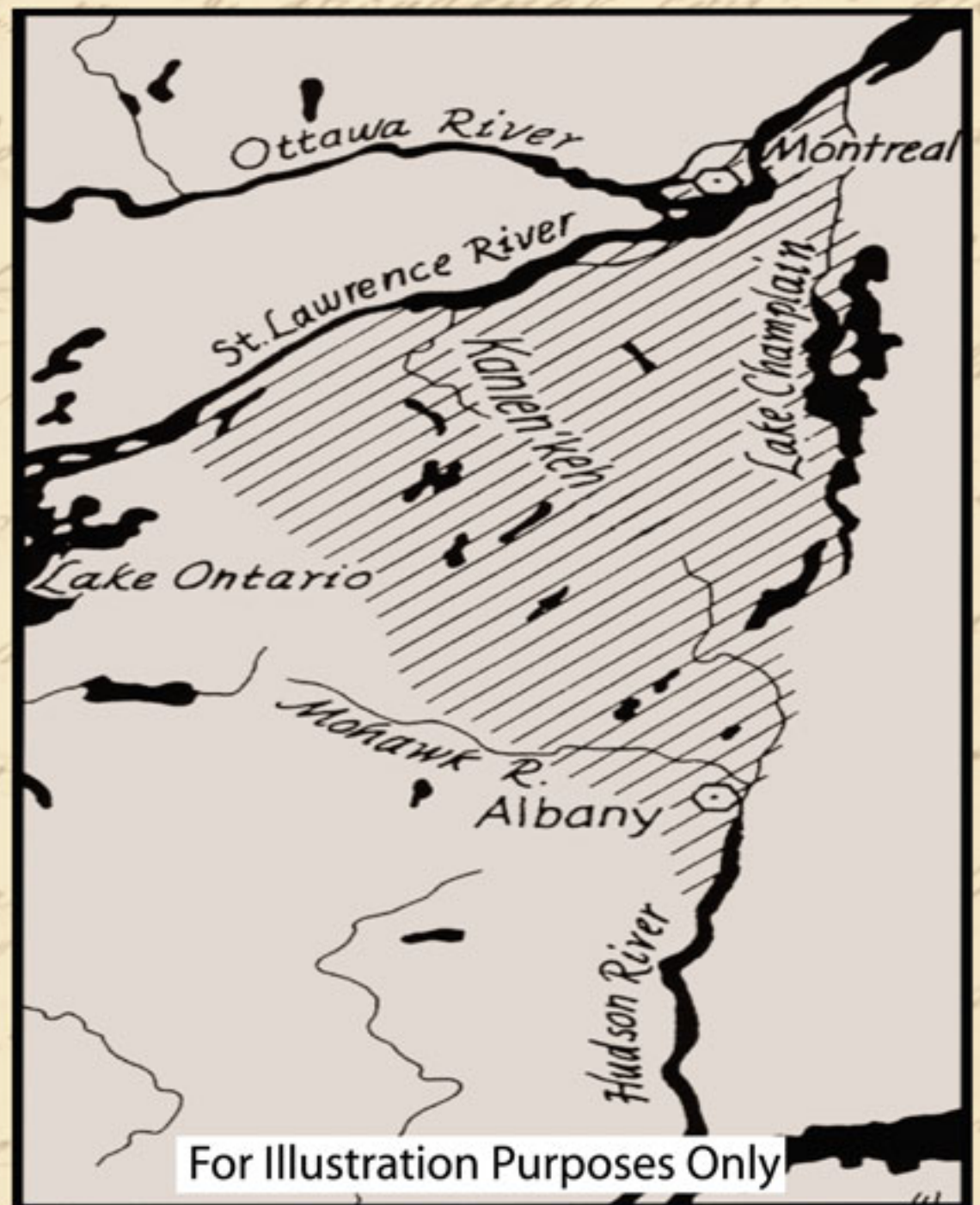
Kanienkeh Territory Map from Historic Kahnawake Series #6 Kanien'keháka Onkwawén:na Raotitiohkwa Cultural Center

After European contact, the Kanien'keháka formed alliances and signed peace and trade treaties with the Dutch, English and the French based on the Two Row Wampum principles of respect, sharing, partnership and peaceful co-existence.